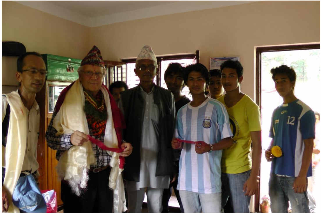
Figure 4: Opening ceremony of Devighat Child Club building