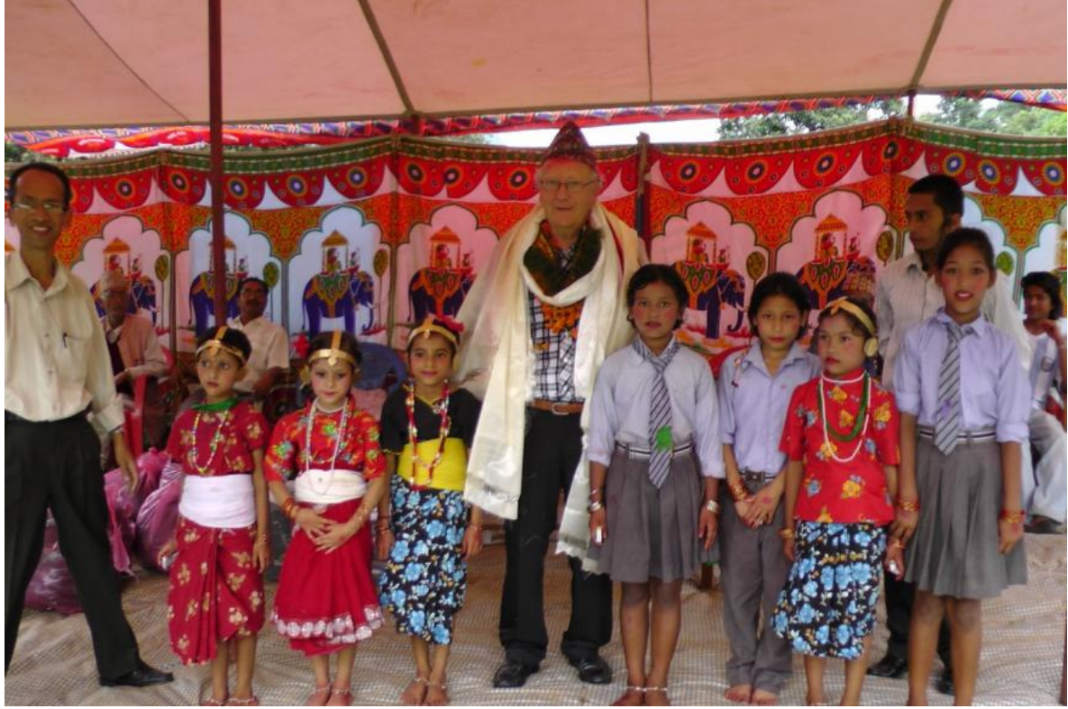
Figure 7: Opening ceremony