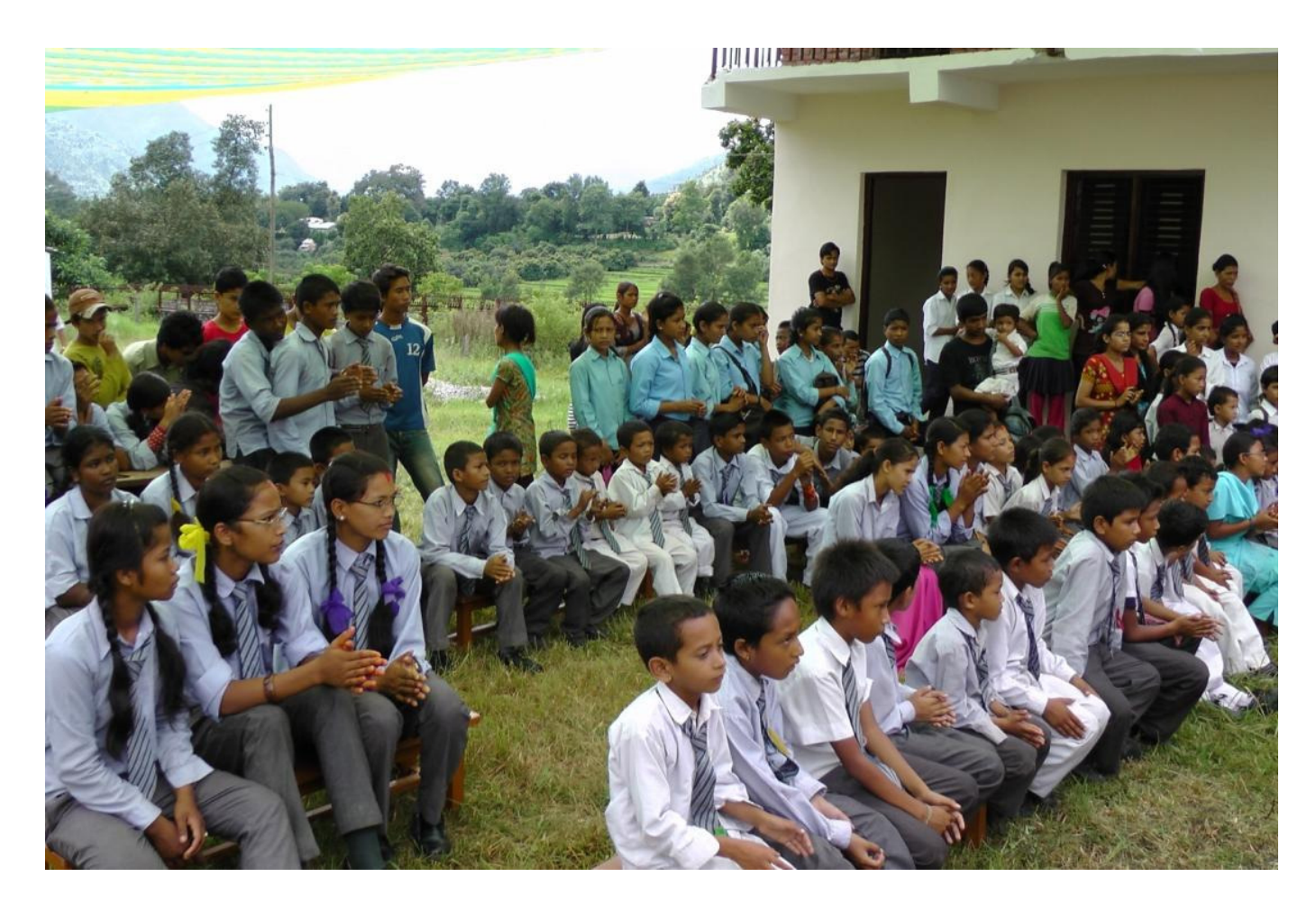
Figure 6: Students, parents and teachers participating Opening ceremony

All the students from the school, scholarship holders from different parts of Devighat, teachers, parents and some locals gathered in the sheltered area. Then the formal program started. Because of the new microphone, presented by Juergen Wahn Foundation, it was very much convenient to reach voice among the group.