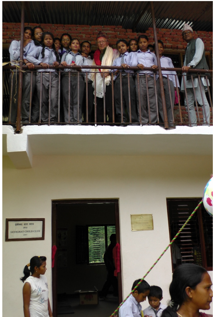
Figure 12: Visiting class room after the program