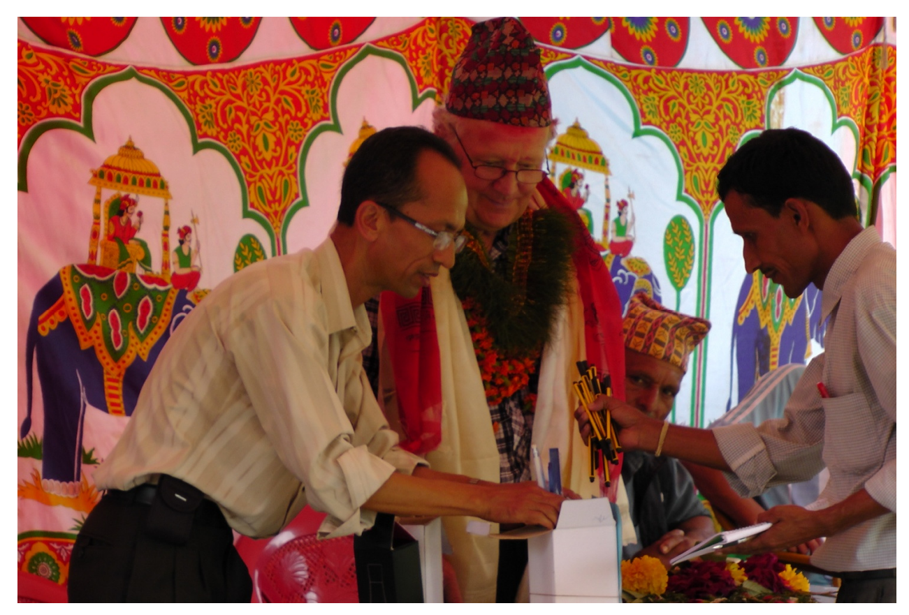
Figure 8: Chairperson from Devighat Bal Club and Headmaster of school receiving gifts from Germany